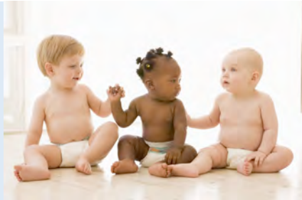
Creating Connected & Empathetic Interpersonal Relationships